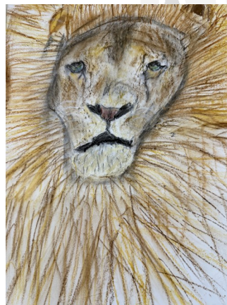
Grade 5SR Aslan from The Lion, the Witch and the Wardrobe