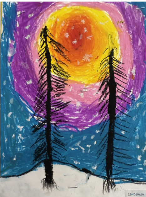
Grade 1 Winter forest