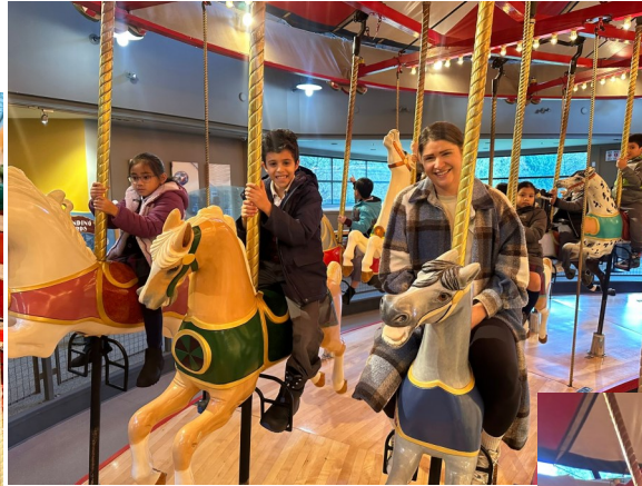
Kindergarten (left) and Grade 2 (Top) at Burnaby Village Museum