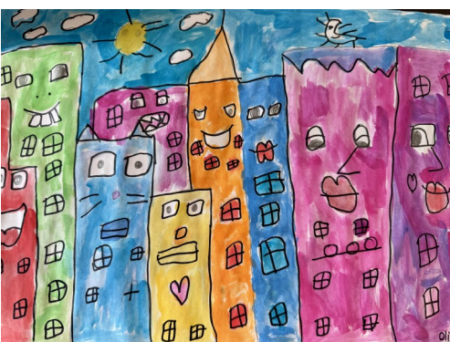
Grade 2 James Rizzi Art Project (left)