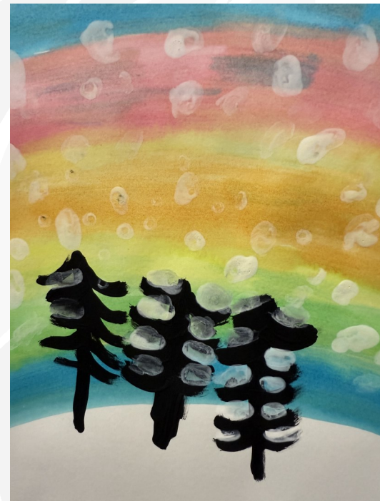
Winter Wonderland Kindergarten V